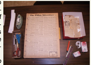
Old Eldon Advertiser

A great big thank you to all our docents, volunteers and board members who give so freely and generously of their time and talents!