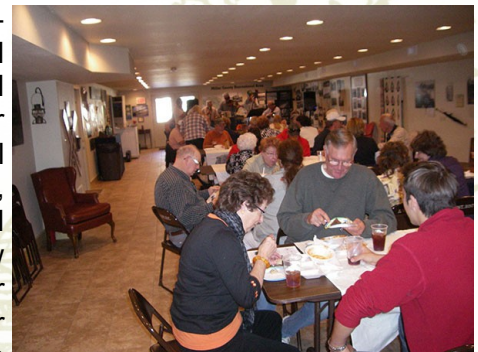
Museum visitors at the Chili Supper

Each year has shown an increase in visitors to our museum, but 2012 shattered all previous records. We hosted school groups from various districts within Miller County, as well as students from the local colleges. Church groups sponsored tours, family reunions brought in folks from all over the USA, and our public events saw increased turnout as well. The Civil War Exhibit attracted history buffs, the Car Show had several new exhibitors and the Veterans Memorial dedication also brought new visitors to the museum grounds. Invariably the comments were, "What a great museum! It's so big; I had no idea there were this many exhibits and of such high quality." We are always pleased with the response to our museum displays and are grateful for the word of mouth recommendations. There is no admission charge and a docent is always available to answer questions.