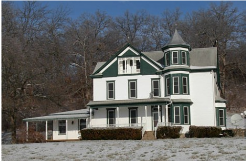
J.R. Wells Home