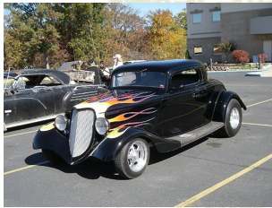
Museum Car Show

Put us on your calendar for a 2013 tour!